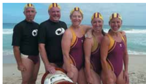
R&R 5 Person Mixed.