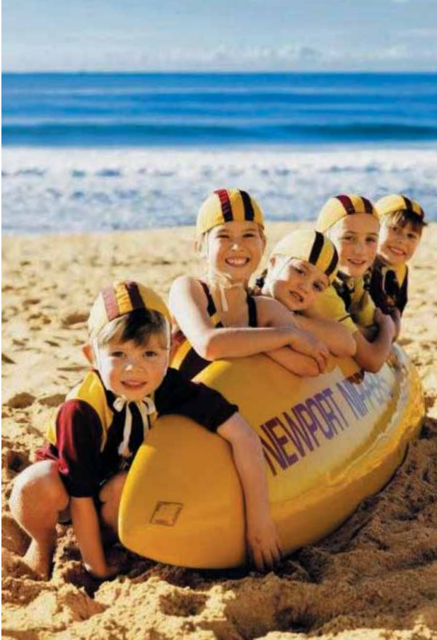
Wish I was big enough to ride this!